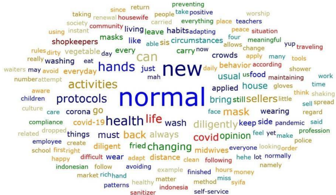
Picture 1. Word cloud of the data using Atlas.ti 8

Referring to the results of data processing in the word cloud, the number of words that appears the most is the word 'normal'. In this word, if we examine more deeply, words appear with positive and negative implications. the word 'normal can be said to be positive if there is a similarity in opinion with the actual definition of the ministry of health. it can be said to be negative if the word 'normal' which appears contradicts the definition of the Ministry of Health. for example the word 'normal' in data 2. normal in data 2 shows that normal is meant to return to normal as it was before Covid-19. even though, what should be normal is living according to health protocols to prevent the corona virus (Covid-19), keeping your distance so that using a mask will become part of everyday life.